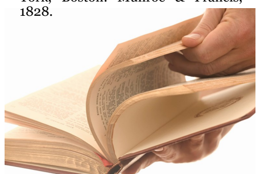
The Grimms' Fairy Tales are translated into over 170 languages. They were added to the UNESCO World Heritage List in 2005.

---. German Popular Stories. New York, Boston: Munroe & Francis,